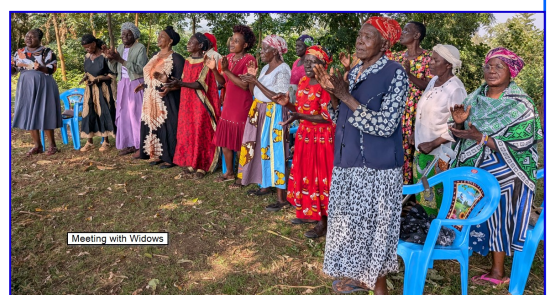
Meeting with Widows

We were able to meet with the widows we support (25). This year we not only gave out 2 nd hand donated goods to them from Australia but also gave them each a food hamper. Picture right.